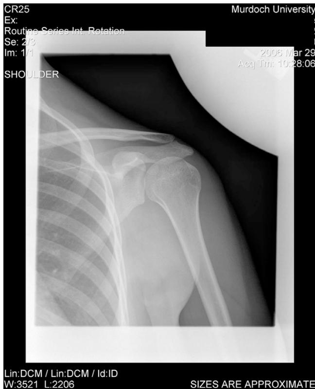
Figure 2 see attached jpeg file named "XRay 2".