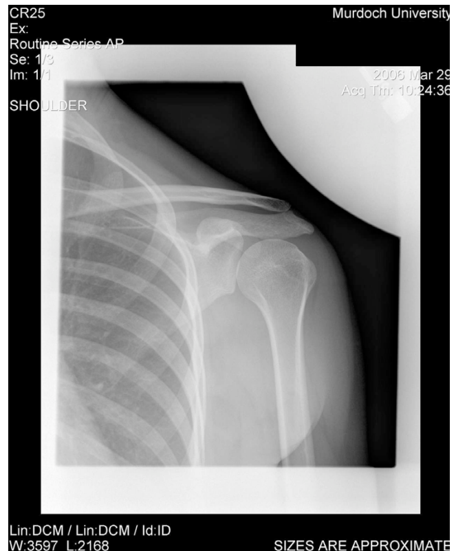
Figure 1 see attached jpeg file named "XRray 1".

Radiological investigation was ordered to rule out an anatomical aetiology (such as shoulder joint dysplasia) and confirm or deny an aberrant motor pattern as the sole cause of dysfunction. This consisted of plain film radiography and video fluoroscopy. A left shoulder series consisting of AP internal rotation, AP external rotation, and AP weighted (3 kg) neutral views (all taken in Grashey position [20]) revealed no bony dysplasia (Figures 1, 2, 3). Video fluoroscopy consisting of AP and axial projections confirmed the suspicion that the humerus subluxated inferiorly at the glenohumeral joint as it moved through the abduction arc. The axial projection showed a significant posterior component to this subluxation. A follow-up projection AP projection with co-contraction of the shoulder showed that these newly combined motor patterns kept the glenohumeral joint stable, making the arc of motion smoother, and reducing the dynamic subluxation. When viewing the following videos note the significant dysrhythmia for 4 repetitions followed by a smoother rhythm from the patient's conscious facilitation of co-contraction (see Additional file 3).