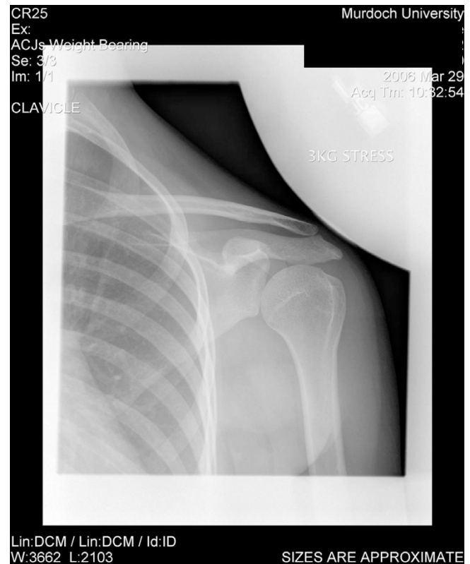
Figure 3 see attached jpeg file named "XRay 3".

of optimum motor patterns and improving muscular balance of the shoulder girdle.