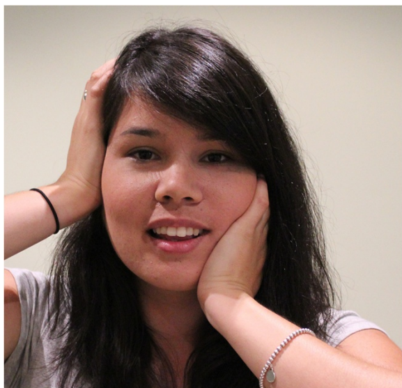
Figure 4 Guided and controlled jaw excursions.

held for up to 10 seconds, depending on the tolerance of the patient. The contraction is then relaxed, while the hand continues to exert some pressure into the chin, deviating it slightly towards the other side. The cycle of isometric contraction is continued at this new point, and repeated in increments until the jaw has deviated to its tolerable limit. The contacts are then reversed and the procedure repeated on the opposite side. A similar process is then applied to incremental opening of the jaw, which is achieved