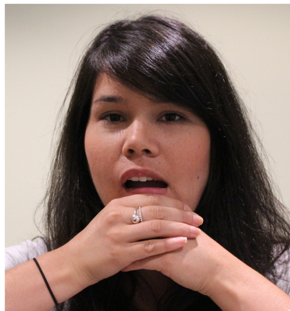
Figure 6 Post-isometric stretches (opening).

by cupping the chin with both hands and resisting an isometric jaw close contraction, then drawing the jaw into an incrementally greater opening distance.