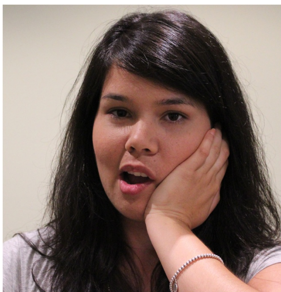
Figure 5 Post-isometric stretches (lateral deviation).

held for up to 10 seconds, depending on the tolerance of the patient. The contraction is then relaxed, while the hand continues to exert some pressure into the chin, deviating it slightly towards the other side. The cycle of isometric contraction is continued at this new point, and repeated in increments until the jaw has deviated to its tolerable limit. The contacts are then reversed and the procedure repeated on the opposite side. A similar process is then applied to incremental opening of the jaw, which is achieved