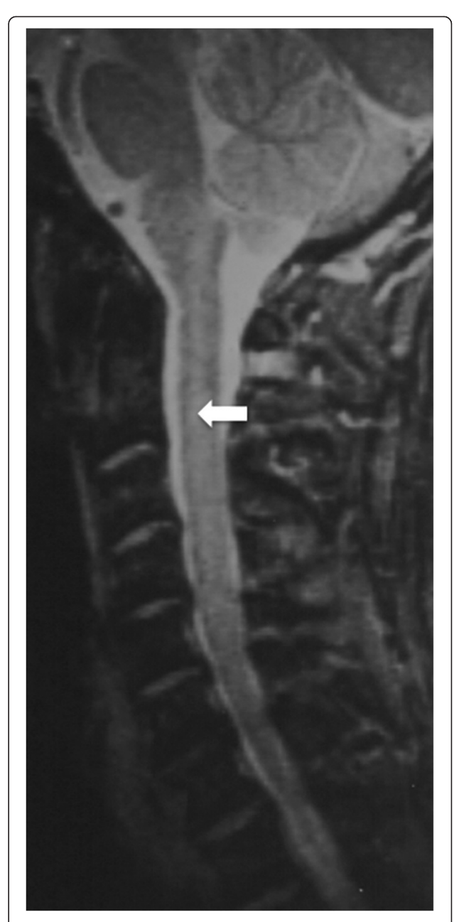
Figure 1 Initial Sagittal MR scan of cervical spine. MR scan, T2 weighted, sagittal view without contrast, reveals diffuse increased signal intensity (arrow) covering the entirety of the medulla and extending to C5-6. The high signal intensity is affecting the central portion of the spinal cord and sparing the outer (subpial) tissues. Initial review concluded the findings were consistent with "infarction vs. contusion."

A 59-year-old male presented to a chiropractic office with a three-week history of pain in the lumbar and lower cervical spine, which began subsequent to moving boxes in his home. Physical examination findings were consistent with musculoskeletal strain and the chiropractor performed spinal manipulation in both the cervical and lumbar spine without consequence. Later that same day the patient began to experience muscular weakness in his lower extremities and loss of bladder control. These serious neurological symptoms prompted him to seek care within an emergency room. MR scans of the cervical spine and brain, with and without contrast, were performed and initially interpreted as normal. A secondary review of the cervical spine MR noted swelling of the cervical cord, without hemorrhage from C1 to C6 (Figure 1), consistent with a clinical impression of "infarction vs. contusion." Attending physicians at the